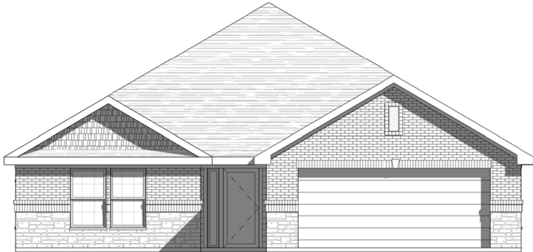
① FRONT ELEVATION "A" PRESENTATION 1/8" = 1'-0"